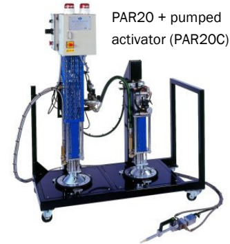
PAR20 + pumped activator (PAR20C)