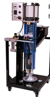
PAR20 + base purge